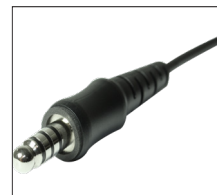
Nexus connector (optional)