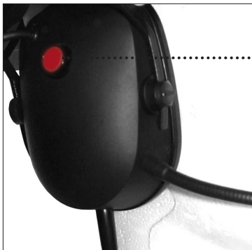
PTT on Shell (Optional)