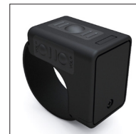
Wireless Finger PTT