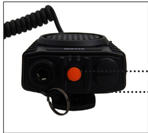
Emergency button (optional) 2 x programmable buttons (optional)