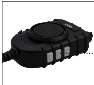
Volume control +/- and microphone mute or loudspeaker mute (optional)