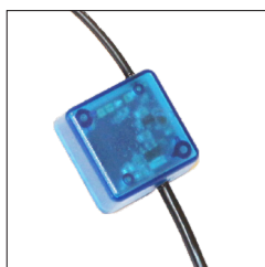
The wireless PTT box comes in a light blue see through box and contains the wireless Aircrypt module and has a LED indicator for pairing purposes.